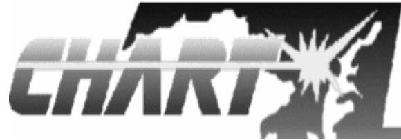
CHART 2004 Evaluation and Comparison